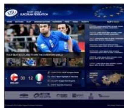
From left: the refreshed RLEF logo...the old logo...and the front page of the new official website www.rlef.eu.com