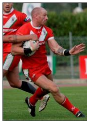
Above: Wales's Gareth Thomas

8 OCTOBER: TWO NEW DIRECTORS ELECTED TO THE BOARD