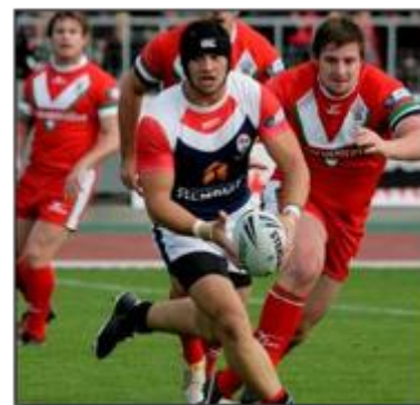
Above, from left to right: action from European Bowl [Malta v Norway]; Shield East [Ukraine v Latvia]; and the Alitalia European Cup [France v Wales]

The year ended with the RLEF contemplating 2011 with relish. We are now operating under a new constitution; are governed by a newly elected Board of Directors; exceedingly conscious of our corporate image; elevating the membership status of National Governing Bodies for the first time in the federation's history; administratively devolved into five regional clusters; possessed of a new eight-year strategy; having completed a diverse international fixture list, and in possession of a re-structured international calendar encompassing the next two world cup cycles; preparing Associate Membership application to the RLIF under the latter's new constitution; with new media and commercial partners; and, consequently, on a solid platform to take rugby league forward into 2011 and beyond.