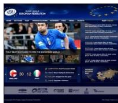
From left: the refreshed RLEF logo...the old logo...and the front page of the new official website www.rlef.eu.com