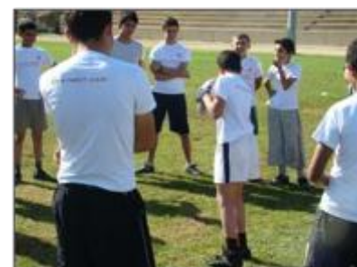
Above: coaching in Serbia, Malta and Lebanon