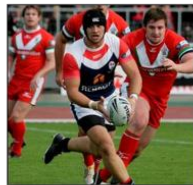
Above, from left to right: action from European Bowl [Malta v Norway]; Shield East [Ukraine v Latvia]; and the Alitalia European Cup [France v Wales]

The year ended with the RLEF contemplating 2011 with relish. We are now operating under a new constitution; are governed by a newly elected Board of Directors; exceedingly conscious of our corporate image; elevating the membership status of National Governing Bodies for the first time in the federation's history; administratively devolved into five regional clusters; possessed of a new eight-year strategy; having completed a diverse international fixture list, and in possession of a re-structured international calendar encompassing the next two world cup cycles; preparing Associate Membership application to the RLIF under the latter's new constitution; with new media and commercial partners; and, consequently, on a solid platform to take rugby league forward into 2011 and beyond.