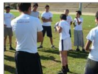
Above: coaching in Serbia, Malta and Lebanon