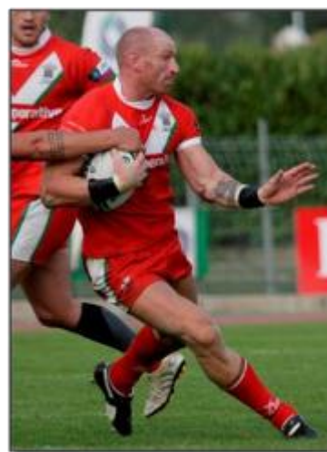
Above: Wales's Gareth Thomas