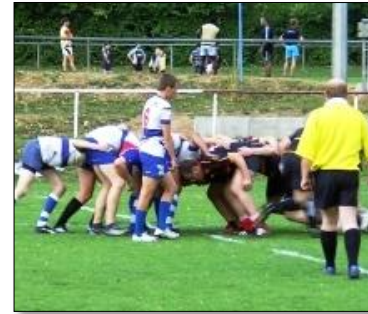
From left: action from the Canadian Championship, Czech Championship, Norway's YIT Premiership, and Germany's Bundesliga