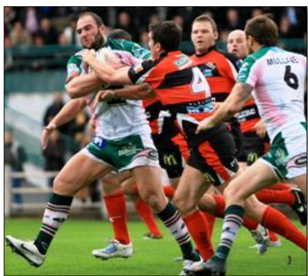
Limoux beat Lezignan in France’s Elite 1 final, to claim the club’s fourth successive championship - May