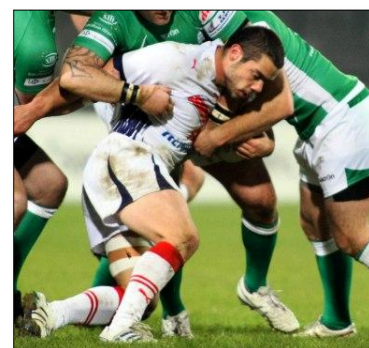
Left to right: the Czech Republic won the European Bowl; Germany edged out Malta and Norway to take the Shield; and France won the Autumn Test series against Scotland and Ireland

Embedding principally open age national championships through lengthening the number of competition rounds [a more reliable growth indicator than adding new teams], registering clubs in line with the respective national legal system and logging participation numbers remains our objective and the best possible way to achieve our mission: long-term, sustainable growth through the cultivation of rugby league culture, where our sport plays a habitual and increasingly more important part in its practitioners' lives.