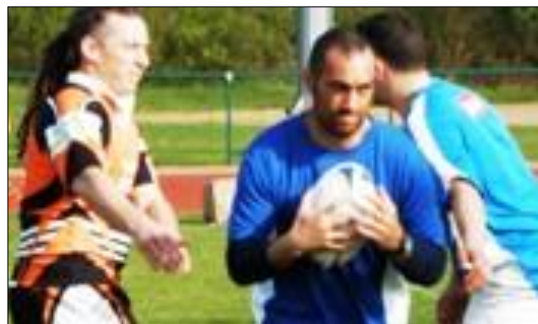
Dutch, Italian and Serbian coach tutor trainees began their education programme at the London launch seminar, supported by the European Commission - March

The site also includes a public membership scheme, soft-launched in the latter part of the year and designed to allow the game's supporters to invest into the organisation.