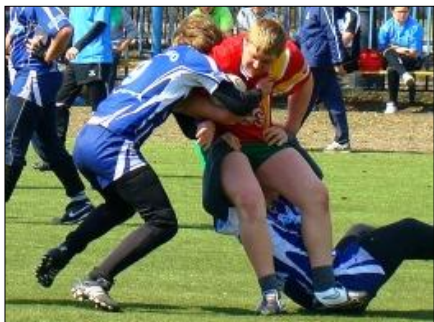
Spartak-Losinka Moscow and Dynamo Moscow U16s compete in the “50 th Anniversary of the Cosmonaut Cup” - April